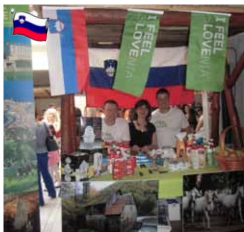
Embassy of the Republic of Slovenia