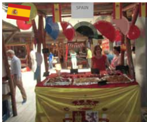
Embassy of the Kingdom of Spain