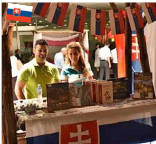
Embassy of the Slovak Republic