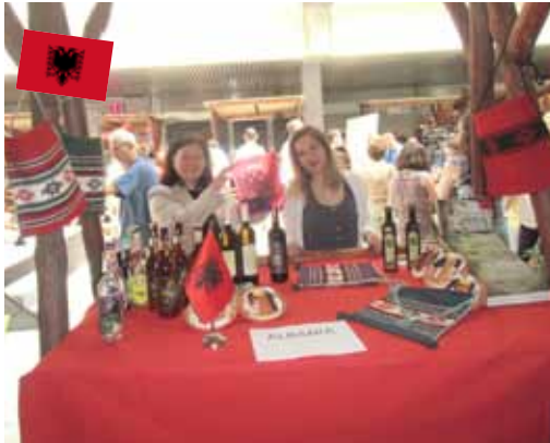
Embassy of the Republic of Albania

Embassies and missions of international organizations participated in the event with bazaar stands, lottery donations and the sale of lottery tickets. The following embassies and organizations had stands promoting their countries and national products and/or their activities in Macedonia: