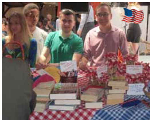
Embassy of the United States of America