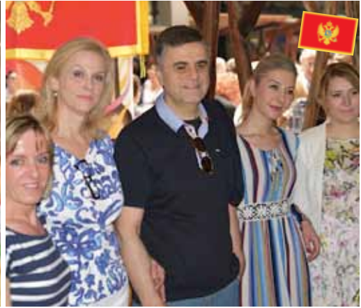
Embassy of Montenegro