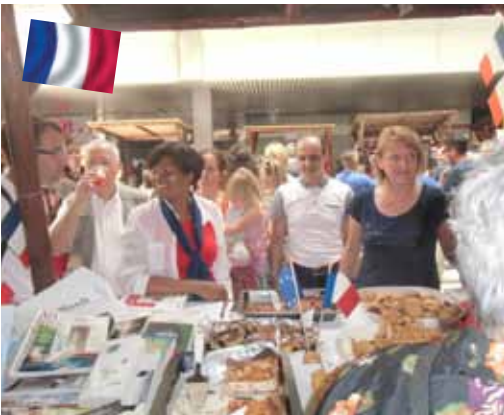
Embassy of the Republic of France