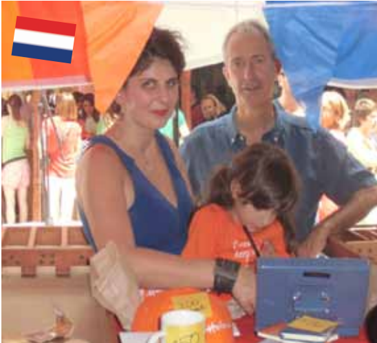
Embassy of the Kingdom of the Netherlands