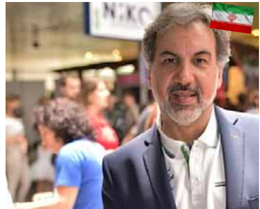
Embassy of the Islamic Republic of Iran