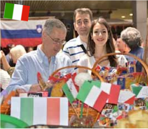
Embassy of the Republic of Italy