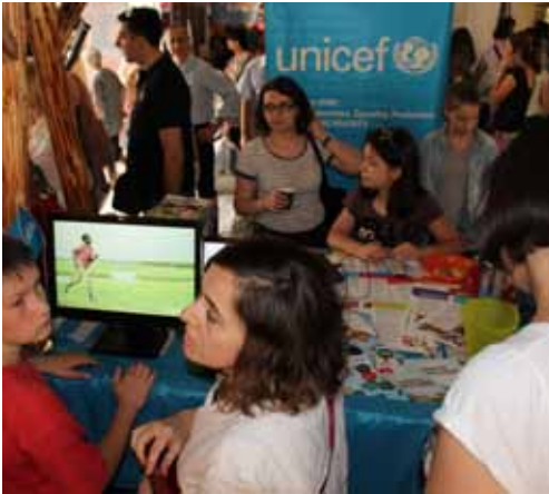
United Nations Children's Fund – UNICEF