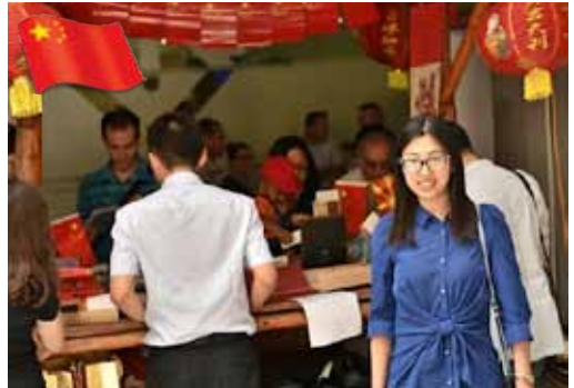
Embassy of the People's Republic of China