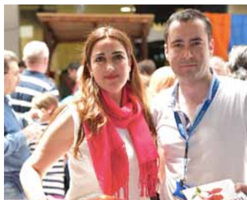
Organization for Security and Co-operation in Europe – OSCE Mission to Skopje