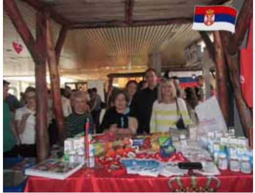
Embassy of the Republic of Serbia