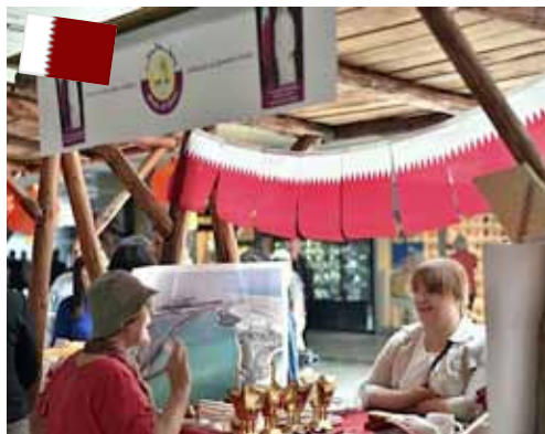
Embassy of the State of Qatar