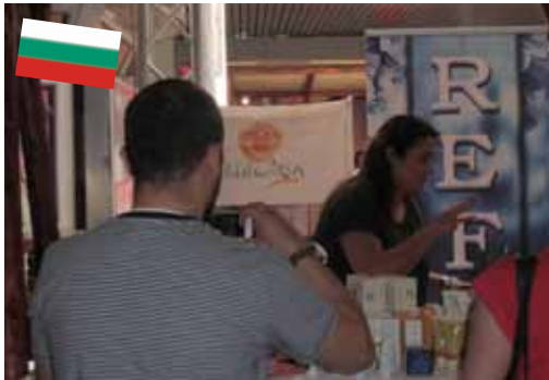
Embassy of the Republic of Bulgaria