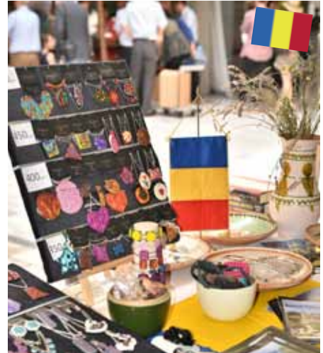
Embassy of Romania