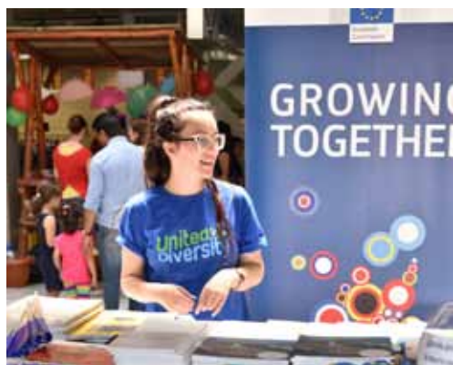
European Union – Delegation of the European Union,