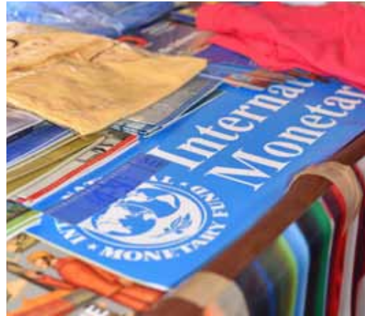
International Monetary Fund – IMF.

For the donations of lottery prizes we are also grateful to the following companies: